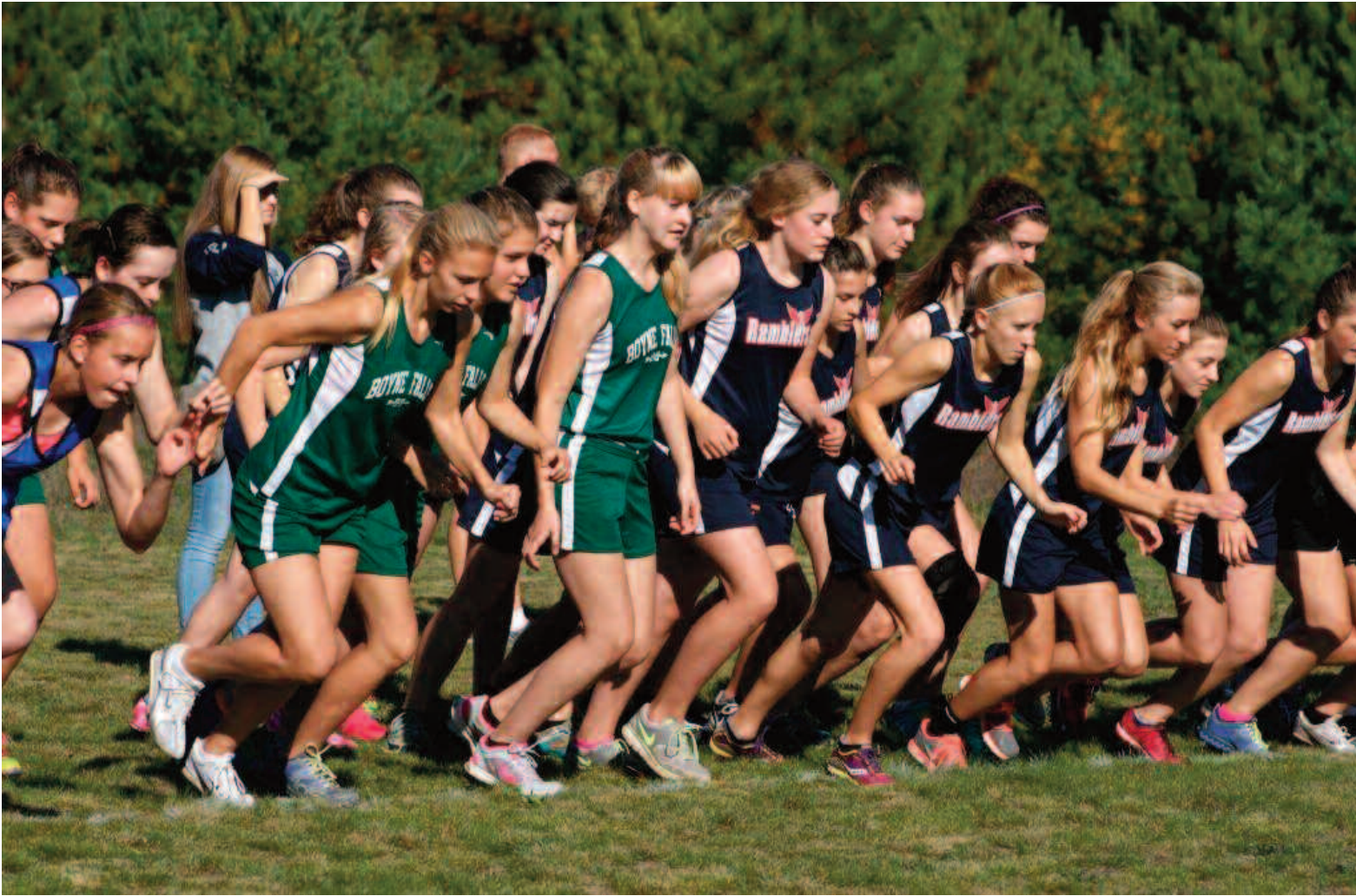
The Boyne Falls and Boyne City girls take off at the start of the Logger Cross Country Invitational on September 27.