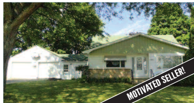
10445 PEEBLES ROAD, ELLSWORTH Beautiful picturesque country setting with five acres to roam, play, have a garden or whatever your heart desires! MLS 441429. Ask for Jennifer Burr. $89,900