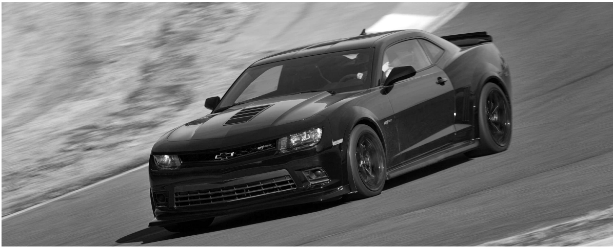
Chevrolet Camaro Z/28 is Motor Trend's 2014 Best Driver's Car. It's the first American-brand car to win the 7-year-old award. Shown here; a 2014 Camaro Z/28 uses media blasting as a solution to prevent tires from slipping on the rim during hard braking and acceleration on the track."