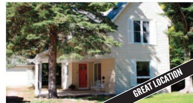
603 BRIDGE STREET, BELLAIRE Three bedroom one bath, three car garage, 2 blocks from the park and within walking distance from Shorts! MLS 442295. Ask for Mike Stark. $79,900