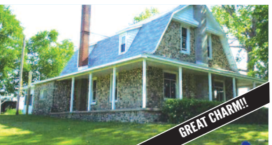
9588 ATWOOD ROAD, CHARLEVOIX This one will WOW you!! This home has 3 large bedrooms 2 full baths and an open and welcoming feeling throughout. MLS 439362. Ask for Holly Nierman. $134,900