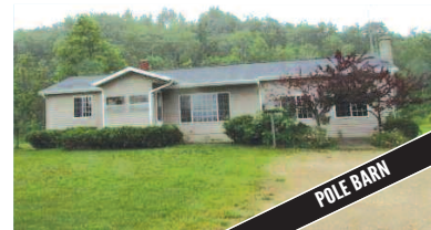
5005 N M66, EAST JORDAN Quality built ranch style home with three bedrooms, two baths, sitting on 1.88 acres. MLS 439197. Ask for Mike Stark. $59,900