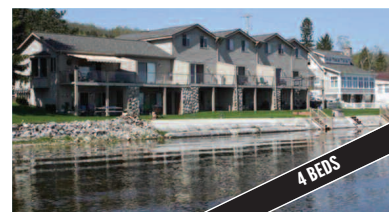
2540 S M-66 HIGHWAY, EAST JORDAN MUST SEE! 2199sq ft condo with 137' of shared waterfront on the beautiful SOUTH ARM of LAKE CHARLEVOIX. MLS 440455. Ask for Mike Stark. $299,900