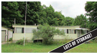
10205 ELLSWORTH • EAST JORDAN Older mobile just a couple miles from town. One and a half car detached garage and a pole barn for the extra toys or equipment. . MLS 441971. Ask for Chris Oliver. $42,500