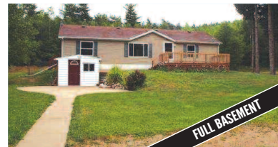
06946 MAPLE GROVE, CHARLEVOIX Quiet country living on 10 acre parcel. Manufactured home with full basement that is mostly finished. MLS 441842. Ask for Mike Stark. $119,000