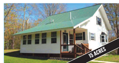
05120 BC/EJ, EAST JORDAN Well constructed like new home close to town. Includes 15 acres with a 30 x 40 insulated, heated pole barn. MLS 440712. Ask for Mike Stark. $169,000